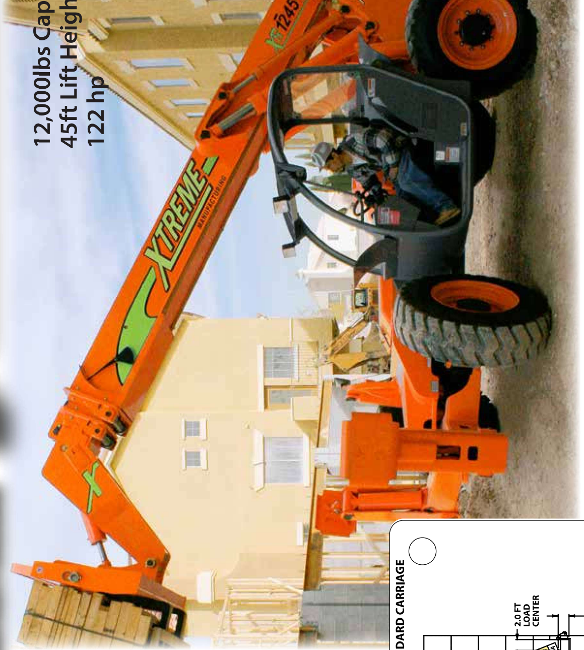
XR1245 LOAD CHART OUTRIGGERS DOWN-STANDARD CARRIAGE